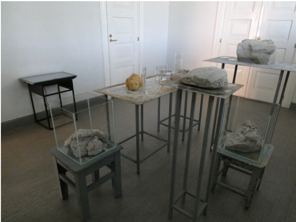
Installation with Video and Sound, Joensuu, Finland (2024)